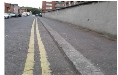
Before and After Photographs